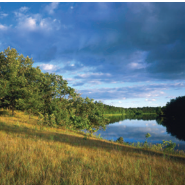
Overlooking the Mississippi River at Crow Wing State Park

Integral to the Parks & Trails Council's work is our ability to purchase land that is preserved in perpetuity as part of the park and trail system in Minnesota. Since 1954 these efforts have translated into over one hundred projects that have preserved more than 10,000 acres of land in Minnesota. In 2012 two important projects were successfully completed.