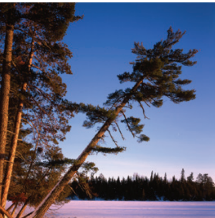
Coon Lake at Scenic State Park in northern Minnesota