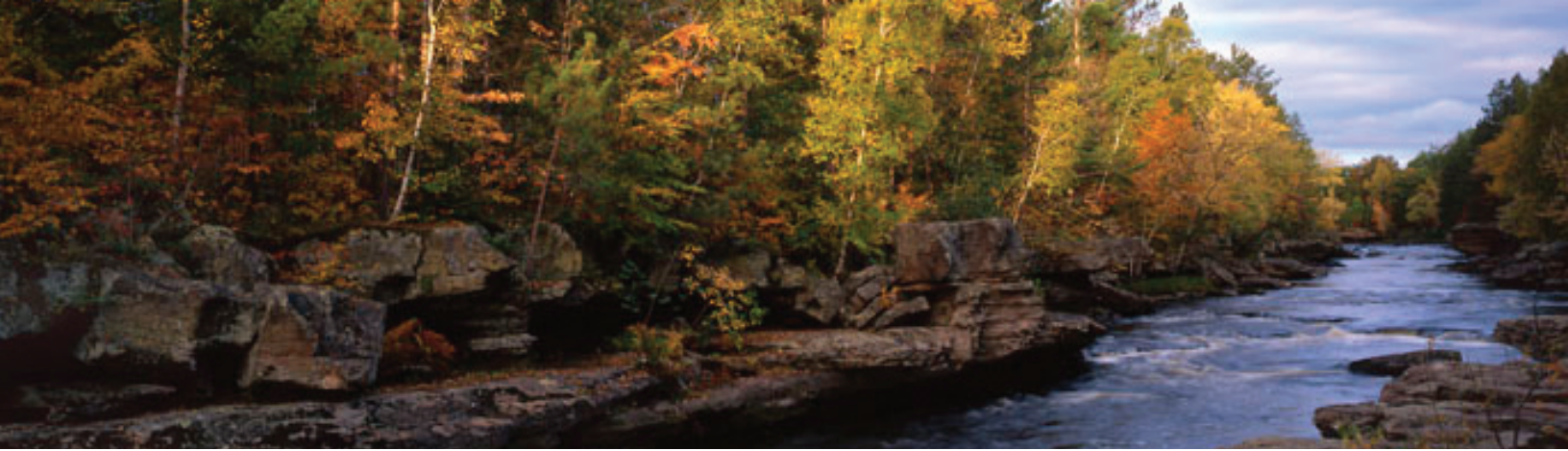
Kettle River at Banning State Park