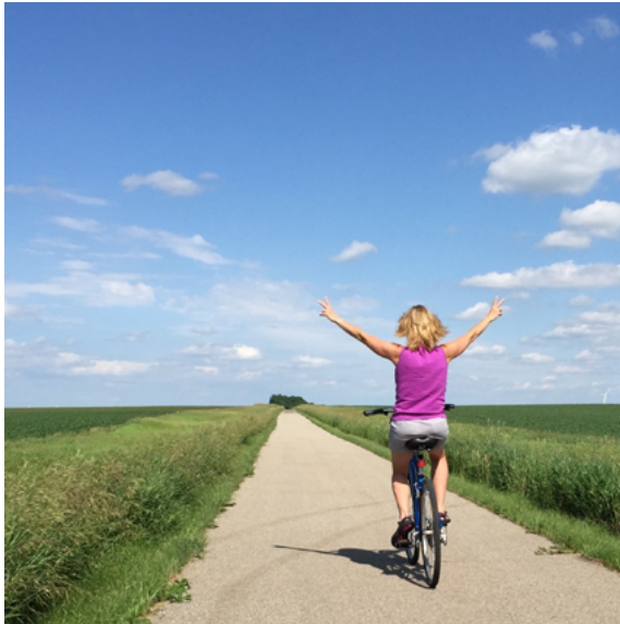
Casey Jones State Trail near Pipestone

Creating awareness of the unique southwestern Minnesota landscape and its natural features