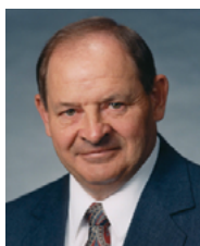
Sen. Gary Dahms