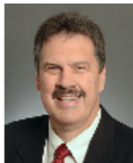
Sen. Paul Utke