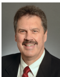
Sen. Paul Utke