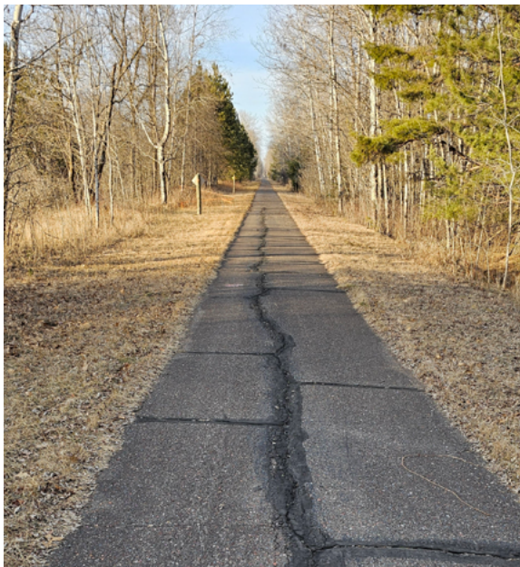
The Willard Munger State Trail between Finlayson and Hinckley.