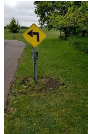
MnDOT Infrared Trail Counter along the Loon Lake Trail in Jackson County, MN.