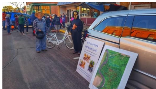
Trunk O' Treat event hosted by Jackson Women of Today.