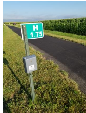
MnDOT Infrared Trail Counter along the Sunset Loop Trail in Jackson, MN.