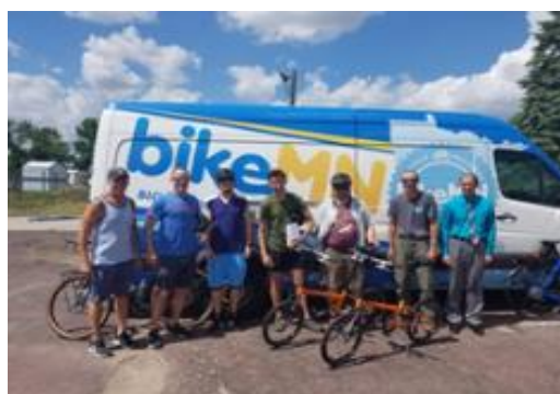
Bicycle Community Workshop (BCW) event hosted by BikeMN.